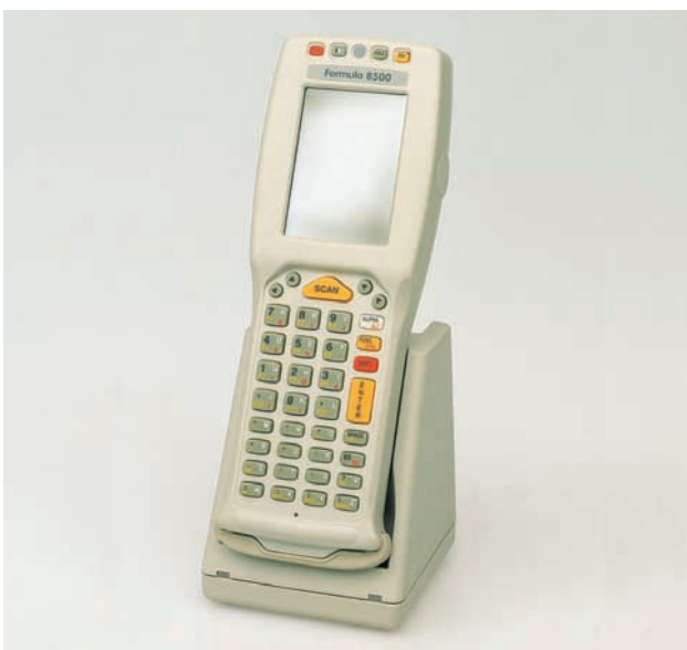
Formula 8500 and Formula 985 Transceiver/Charger

Thus, the Laser Hand-Held PC Formula 8500 can communicate in different modes. Transmission speeds can reach 115 Kbps through a modem with PCMCIA certified adapters or through LAN with PCMCIA certified Ethernet or Token Ring adapters.