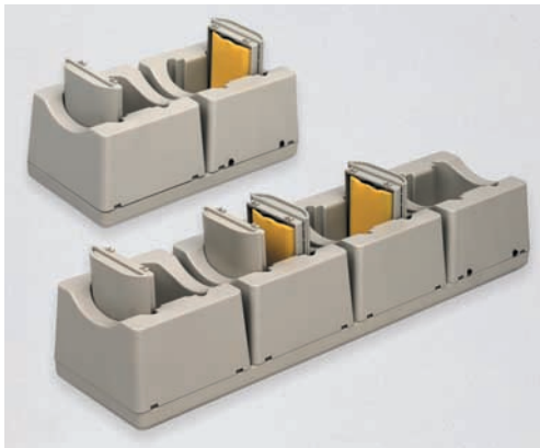
Formula 975/4 and Formula 975/8

The Formula 975 Multicharger is the ideal answer for battery recharging requirements in applications where intense use of the terminal and therefore extremely reduced rest time is necessary.