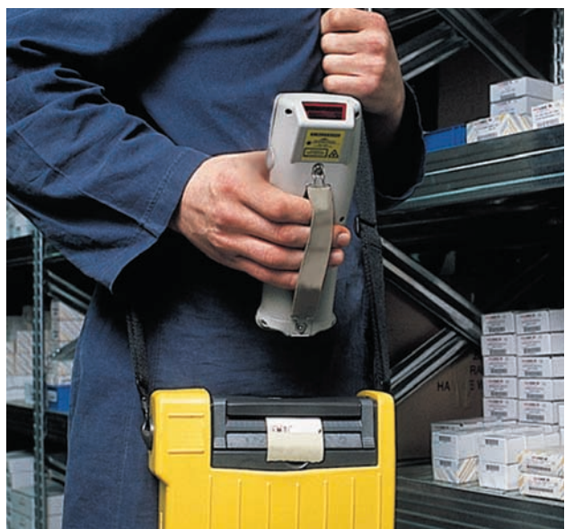
Mobile cradle F985/V